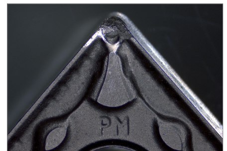
Indexable insert, shows tool wear. Reflected light, ringlight, zoom 0.8x