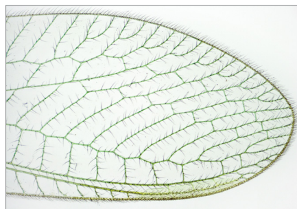
Green lacewing Transmitted light brightfield